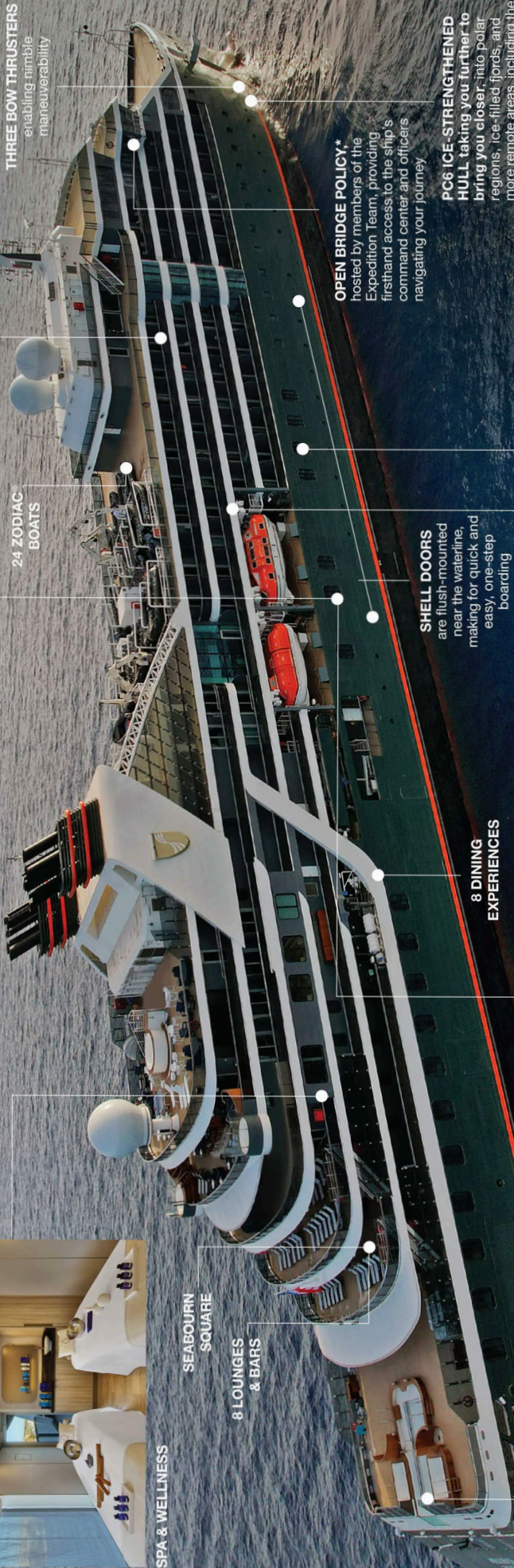
OPEN BRIDGE POLICY,* hosted by members of the Expedition Team, providing firsthand access to the ship's command center and officers navigating your journey

PC6 ICE-STRENGTHENED HULL taking you further to bring you closer into polar regions, ice-filled fjords, and more remote areas, including the heart of the Northwest Passage and exotic destinations around the world