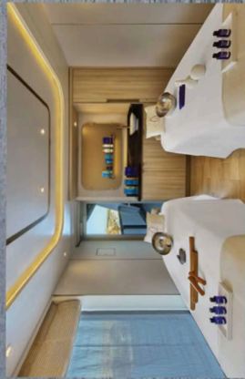
SPA & WELLNESS

Seabourn Venture and Seabourn Pursuit are designed and purpose-built specifically for exploring in unprecedented elegance and ease in the most coveted and unspoiled destinations on Earth. Get set for an ultra-luxury expedition experience like no other.