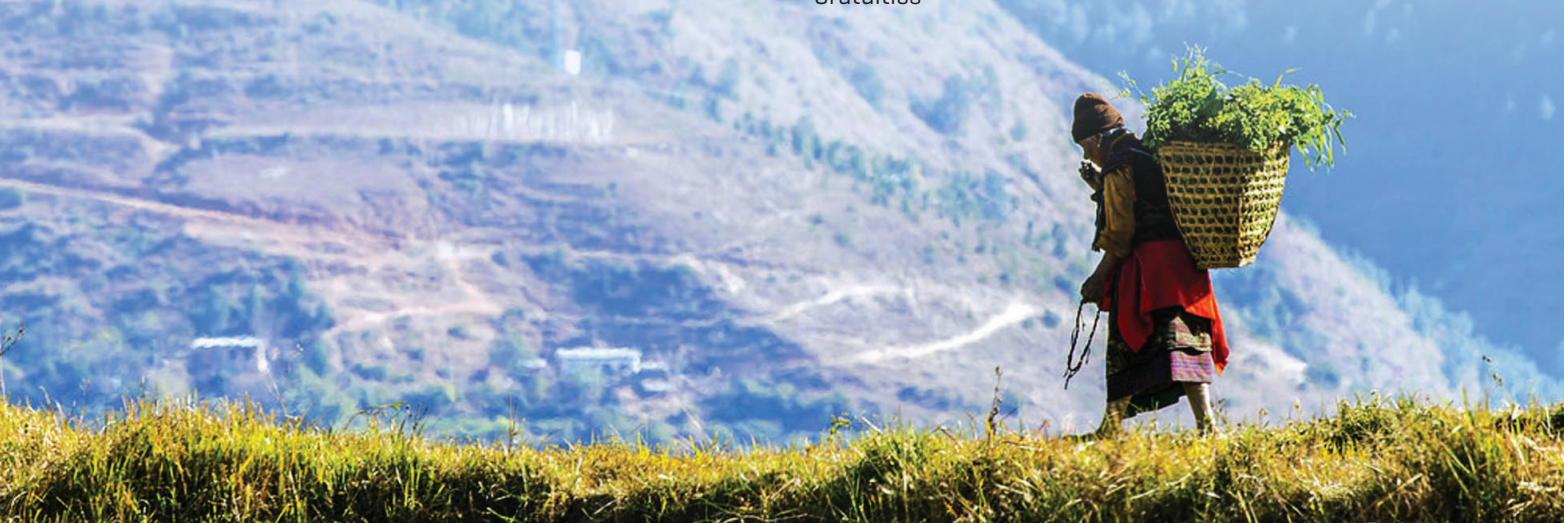
Note Pukekohe Travel reserves the right to correct errors and omissions contained within this brochure without recourse.